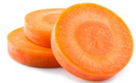
VITAMIN A Retinyl palmitate