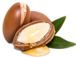
ARGAN OIL Argania spinosa L.