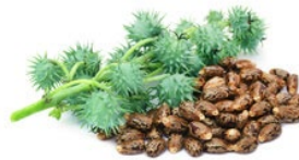
CASTOR OIL Ricinus communis