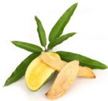
MANGO SEED BUTTER Mangifera indica