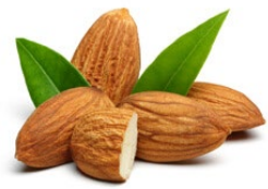
SWEET ALMOND OIL Prunus amygdalus dulcis