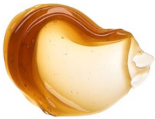
HEMP EXTRACT Cannabis sativa L.

Ingredients: MANGIFERA INDICA SEED BUTTER, COCOS NUCIFERA OIL, THEOBROMA CACAO SEED BUTTER, CAPRYLIC/CAPRIC TRIGLYCERIDE, VITIS VINIFERA SEED OIL, RICINUS COMMUNIS SEED OIL, CERA ALBA, GLYCERIN, PRUNUS AMYGDALUS DULCIS OIL, SUCROSE LAURATE, CITRUS AURANTIUM DULCIS FRUIT WATER, CANNABIS SATIVA BIOMASS EXTRACT, TOCOPHEROL