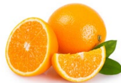
SWEET ORANGE HYDROLATE Citrus aurantium dulcis