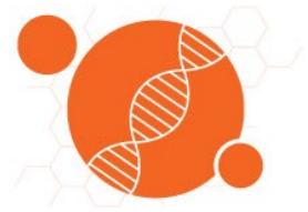
SOLUBLE COLLAGEN Collagen