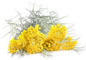
ITALIAN IMMORTELE FLOWER HYDROLATE Helichrysum italicum