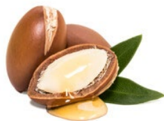
ARGAN OIL Argania spinosa L.