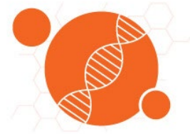
SOLUBLE COLLAGEN Collagen