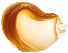
HEMP EXTRACT Cannabis sativa L.

Ingredients: AQUA, HELICHRYSUM ITALICUM FLOWER WATER, ARGANIA SPINOSA KERNEL OIL, BUTYROSPERMUM PARKII BUTTER, CAPRYLIC/CAPRIC TRIGLYCERIDE, SIMMONDSIA CHINENSIS SEED OIL, RICINUS COMMUNIS SEED OIL, GLYCERIN, CETEARYL OLIVATE, SORBITAN OLIVATE, TOCOPHEROL, GLUCONOLACTONE, SODIUM BENZOATE, DEHYDROACETIC ACID, BENZYL ALCOHOL, CETYL ALCOHOL, SODIUM HYALURONATE, HELICHRYSUM ITALICUM FLOWER OIL, CANNABIS SATIVA LEAF EXTRACT, SODIUM ASCORBYL PHOSPHATE, RETINYL PALMITATE, SOLUBLE COLLAGEN, ALLANTOIN, UBIQUINONE, SQUALANE, TOCOPHERYL ACETATE, XANTHAN GUM, LINALOOL, D-LIMONENE, CITRAL, BENZYL CINNAMATE