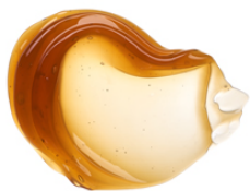
HEMP EXTRACT Cannabis sativa L.

Ingredients: CANNABIS SATIVA SEED OIL (AND) CANNABIS SATIVA LEAF EXTRACT, PRUNUS AMYGDALUS DULCIS OIL, RICINUS COMMUNIS SEED OIL, C10-18 TRIGLYCERIDES, HYDROGENATED OLIVE OIL STEARYL ESTERS, HYDROGENATED CASTOR OIL BEHENYL ESTERS, CETEARYL ALCOHOL, BUTYROSPERMUM PARKII BUTTER, COCOS NUCIFERA OIL, CAPRYLIC/CAPRIC TRIGLYCERIDE, BIS-DIGLYCERYL POLYACYLADIPATE-2, PERSEA GRATISSIMA OIL, POLYGLYCERYL-2 SESQUIOLEATE, TOCOPHERYL ACETATE, AROMA (VANILLA), HELIANTHUS ANNUUS HYBRID OIL (AND) ECHINACEA PURPUREA ROOT EXTRACT, RETINYL PALMITATE