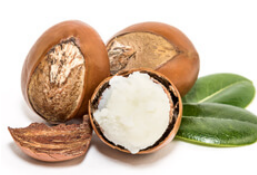
SHEA BUTTER Butyrospermum parkii