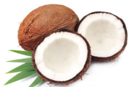
COCONUT OIL Cocos nucifera